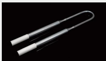
Silicon Molybdenum Heating Element