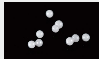
Pure Zirconium Beads